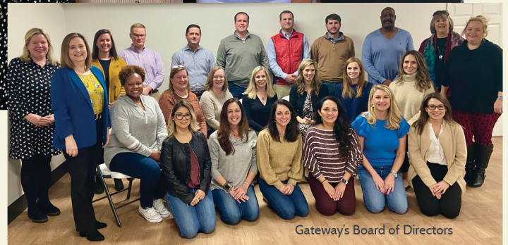
Gateway's Board of Directors